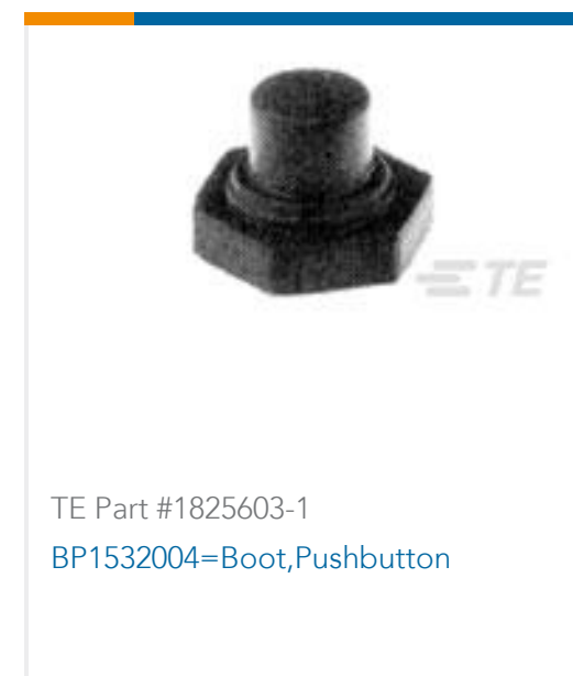
TE Part #1825603-1 BP1532004=Boot, Pushbutton