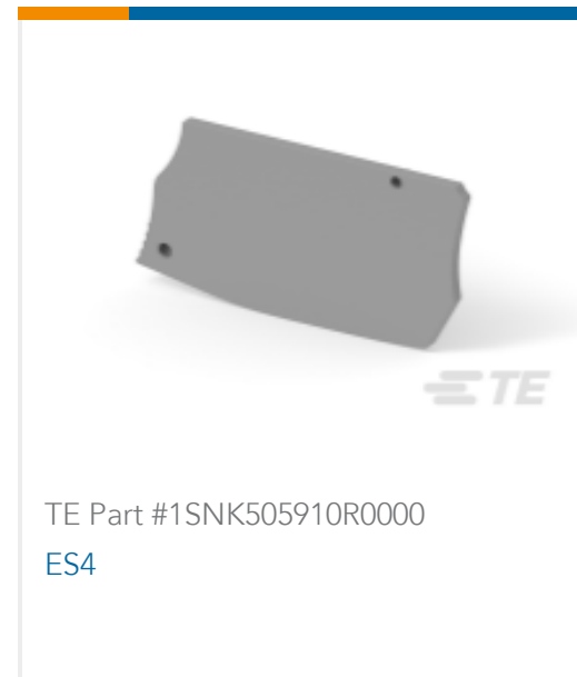
TE Part #1SNK505910R0000 ES4