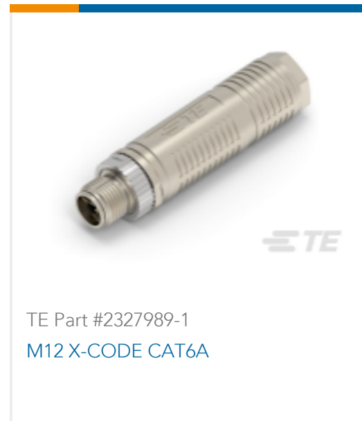
TE Part #2327989-1 M12 X-CODE CAT6A