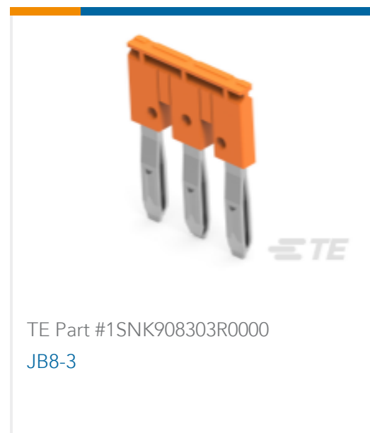
TE Part #1SNK908303R0000 JB8-3