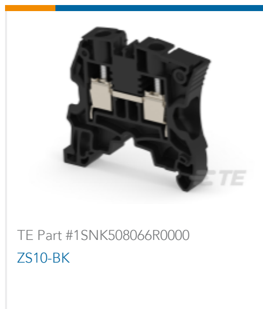
TE Part #1SNK508066R0000 ZS10-BK