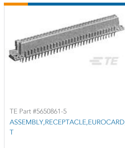
TE Part #5650861-5 ASSEMBLY, RECEPTACLE, EUROCARD, T