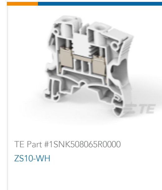
TE Part #1SNK508065R0000 ZS10-WH