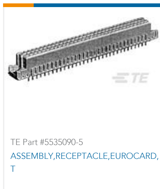
TE Part #5535090-5 ASSEMBLY, RECEPTACLE, EUROCARD, T