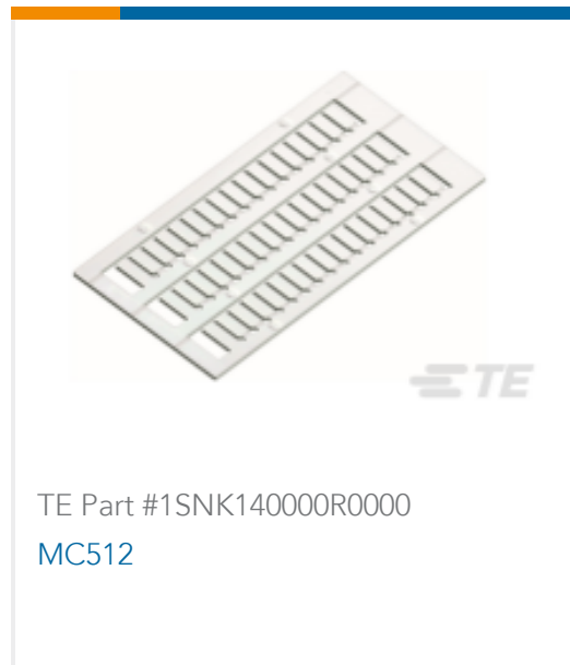
TE Part #1SNK140000R0000 MC512