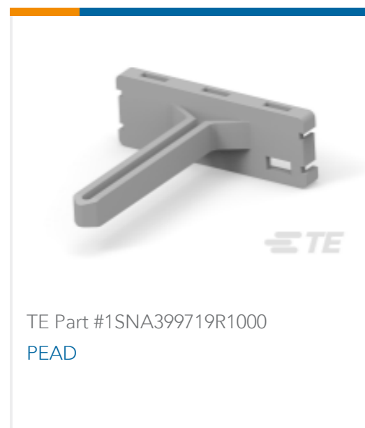
TE Part #1SNA399719R1000 PEAD