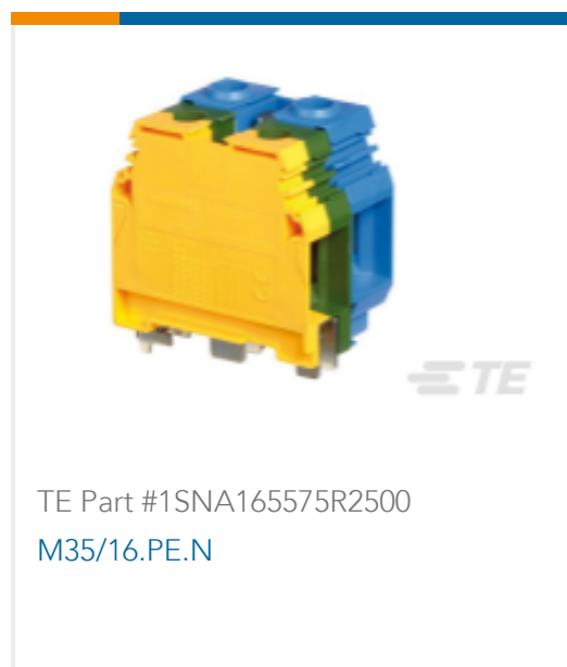
TE Part #1SNA165575R2500 M35/16.PE.N