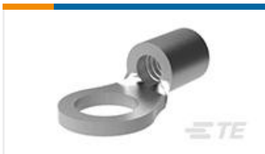
TE Part #2-35476-1 TERMINAL,SOLIS R 12-10 6