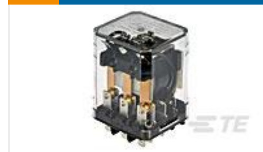
TE Part #9-1393117-0 KUP-14A35F-120=KU