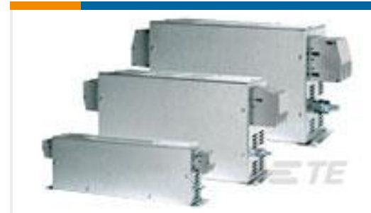
TE Part #1609989-5 55BCF10=F8236