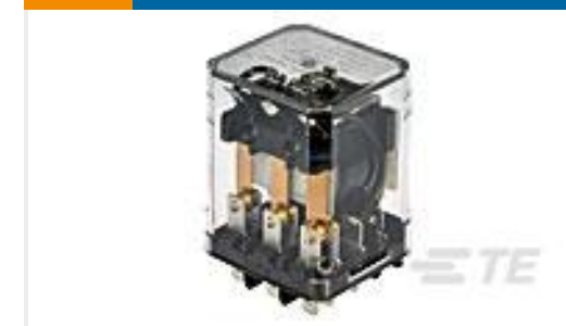
TE Part #2-1393118-7 KUP-14D35-24=KU