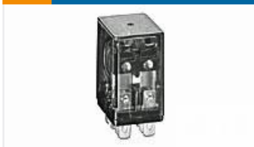
TE Part #4-1393144-0 K10P-11A15-120=K10/K20