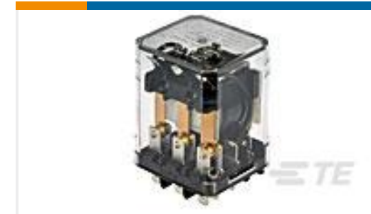
TE Part #1-1393118-2 KUP-14D15-110=KU