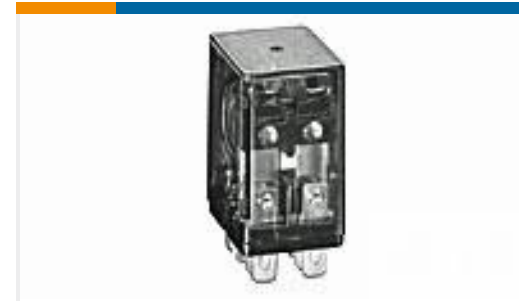
TE Part #5-1393144-7 K10P-11D15-24=K10/K20