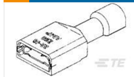
TE Part #2-520183-4 ULTRA-FAST 250 ASY REC 22-18 TPPB