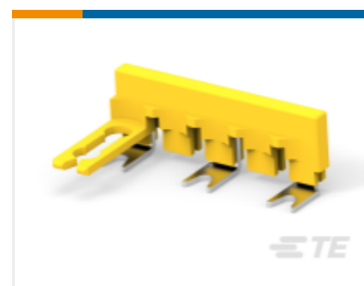
TE Part #1SNK900655R0000 SC-JB8-5