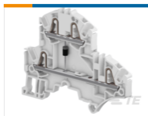
TE Part #1SNK705214R0000 ZK2.5-D-CH-DU