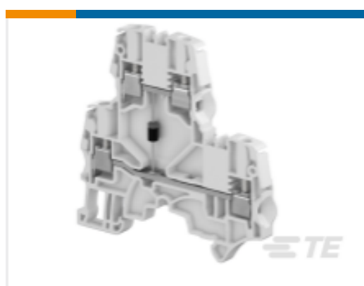
TE Part #1SNK505215R0000 ZS4-D-CH-DU