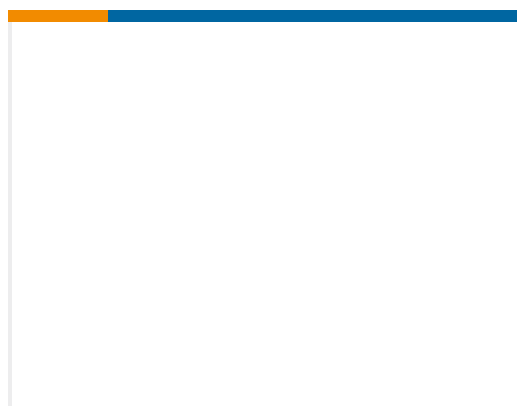
TE Part #1SNA399787R0500 CPBP2