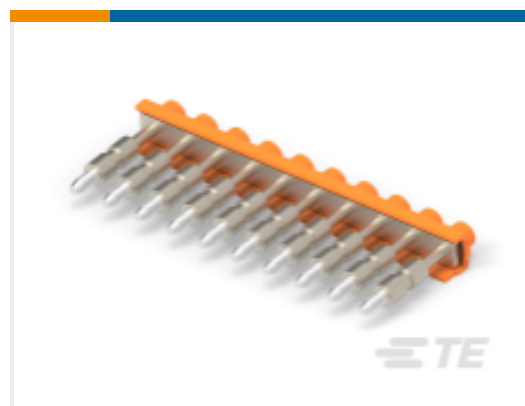
TE Part #1SNK908910R0000 JB8-10-R1