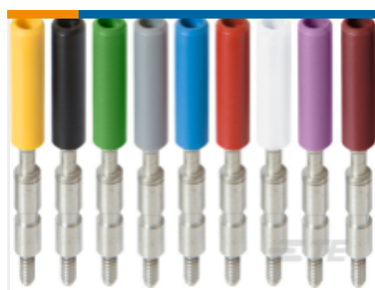
TE Part #1SNA206682R0300 AJS9-GR