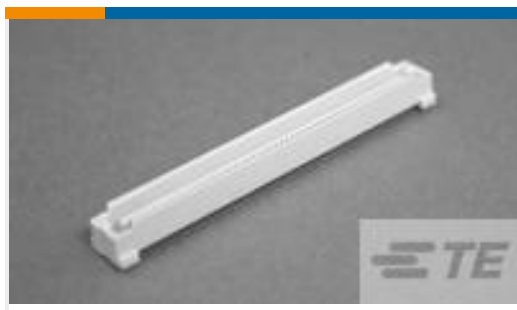
TE Part #5177984-6 0.8FH,P05H.5,140,08/Sn,TU