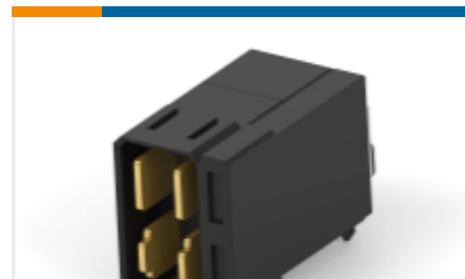
TE Part #2180490-1 IMP,PWR,4PR,HDR,R-HLD,1X,802-1,N /A