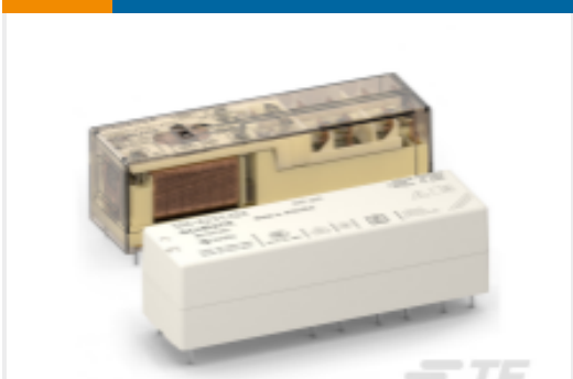
TE Part #1393260-4 Force Guided Relay with 6 contacts