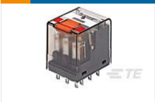
TE Part #9-1415536-4 PT381024