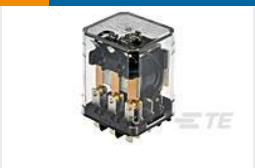
TE Part #8-1393117-7 KUP-14A35-120=KU