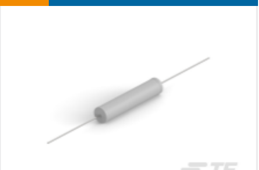
TE Part #6-2176415-0 8W STD M/OX 5% 8K2