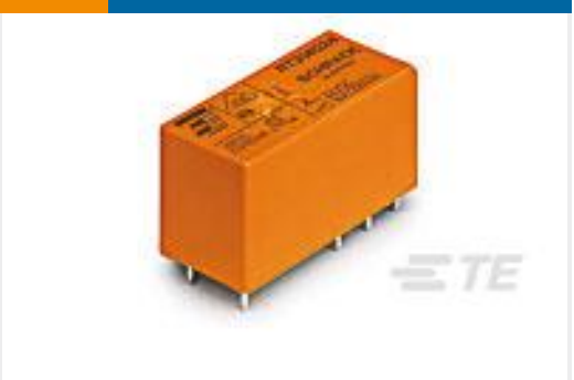
TE Part #1393240-6 RT314615