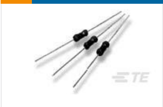
TE Part #1625893-9 5W SM M/OX 5% 100K