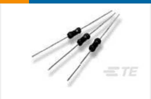
TE Part #1625893-2 5W SM M/OX 5% 39K