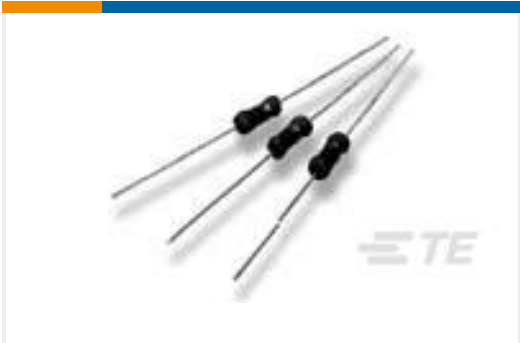
TE Part #8-1879354-9 RR03 5% 1K5 AMMO