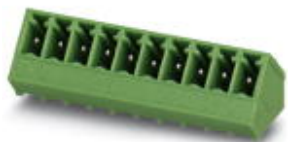
The figure shows the standard item

PCB headers, number of positions: 5, pitch: 3.81 mm, color: black, contact surface: Gold