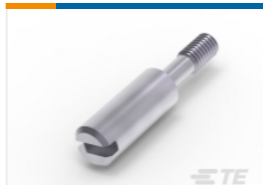
TE Part #T0931003003-000 CODING-PIN-M3