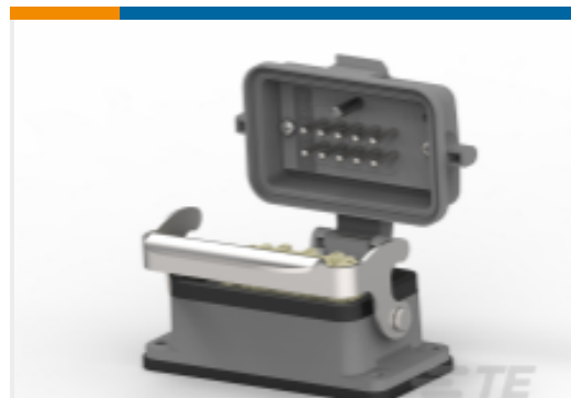
TE Part #T2120100219-000 ZGG-10DSTK,1-7,2-8,3-9,4-6,5-10