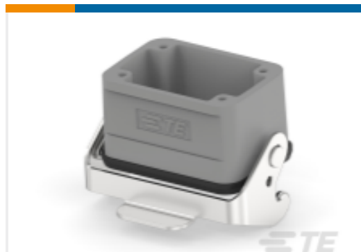
TE Part #T1730060000-000 H6B-TBF-T