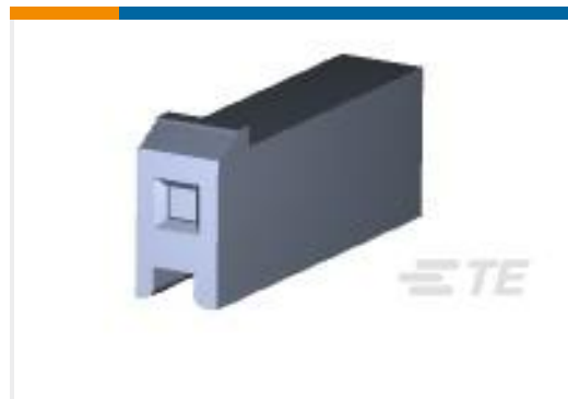
TE Part #640250-1 01P SL156 HSG W/LCK RAMP NATL