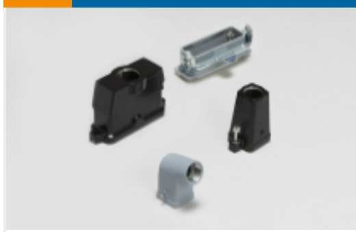
Rectangular Connector Hoods & Bases (1258)