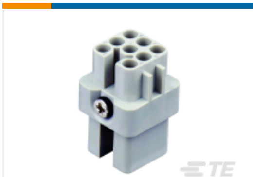
TE Part #T2020082201-000 HD-008-F