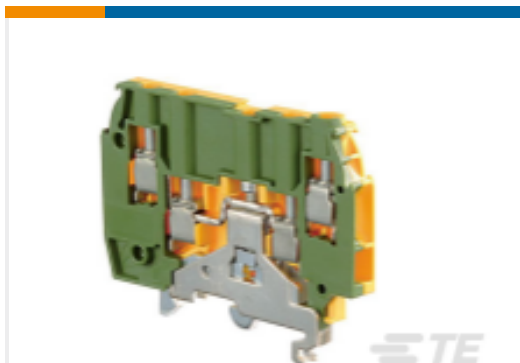
TE Part #1SNA195638R2300 M4/6.4A.P