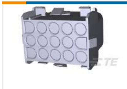
TE Part #1-480711-9 15P UMNL CAP HSG BLK