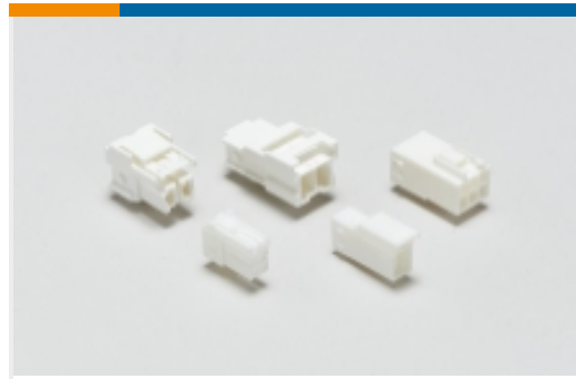
Rectangular Power Connectors(32)