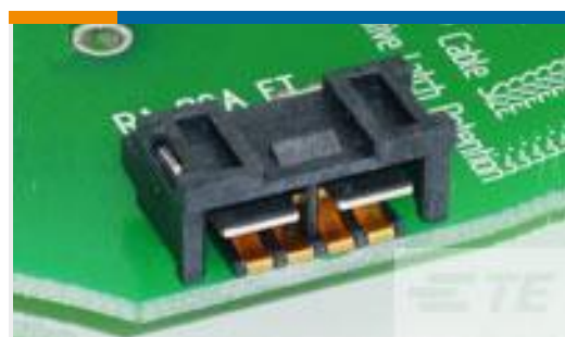
TE Part #1982295-2 ELCON MINI 2P RA HEADER, W/O CODING