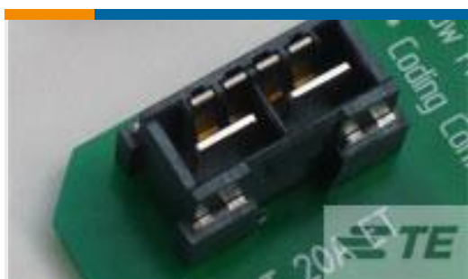
TE Part #2042274-2 ELCON MINI 2P VERT HEADER, W/O CODING