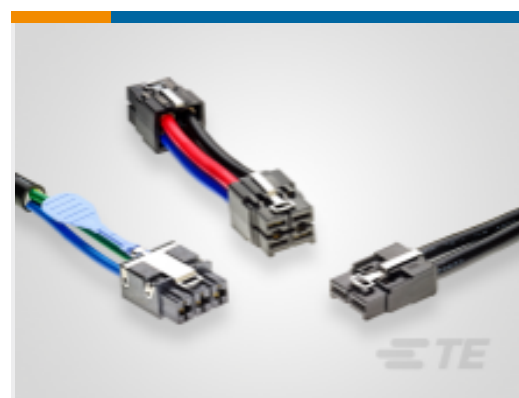
TE Part #2304889-1 CA, ET, 4POS, NO PULL-TAB, NO DETECT, NO S