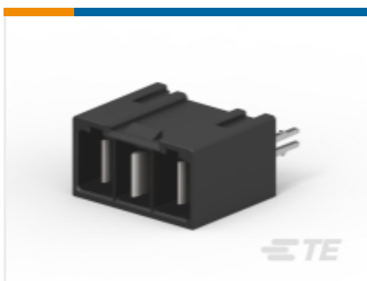
TE Part #2204585-2 ELCON MINI 3P VERT HEADER, SOLDER, T/P