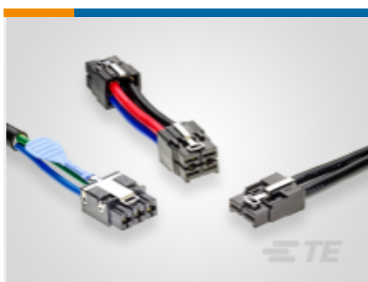
TE Part #2304890-1 CA, ET, 4POS, NO PULL-TAB, NO DETECT, SHIEL