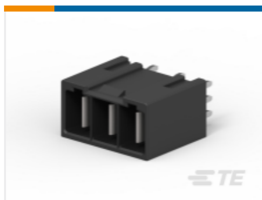
TE Part #2204585-3 ELCON MINI 3P VERT HEADER, PRESS-FIT, STD