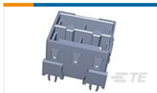
TE Part #2173211-1 ELCON MINI 4P VERT HEADER, SHIELDED, SOL