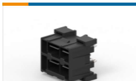
TE Part #2173132-2 ELCON MINI 4P VERT HEADER, UNSHIELDED, P/F