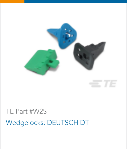
TE Part #W2S Wedgelocks: DEUTSCH DT