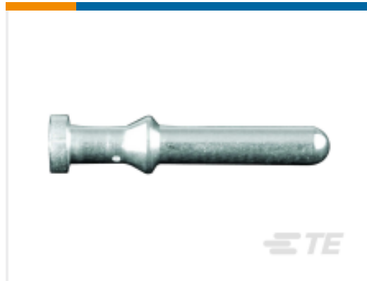
TE Part #T2040001100-000 CMM-10