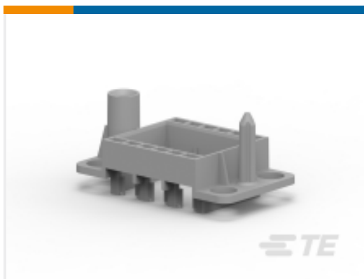
TE Part #T2071104101-000 H10BP-T3-M DOCKING FRAME_FLOATING