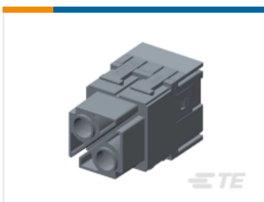
TE Part #T2111028201-000 HMN-D2-FC