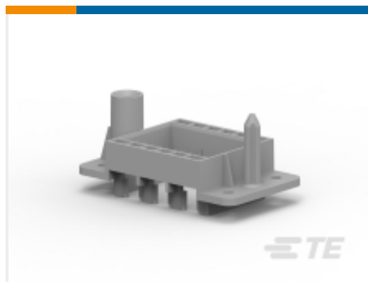
TE Part #T2071104201-000 H10BP-T3-F DOCKING FRAME_FIXED