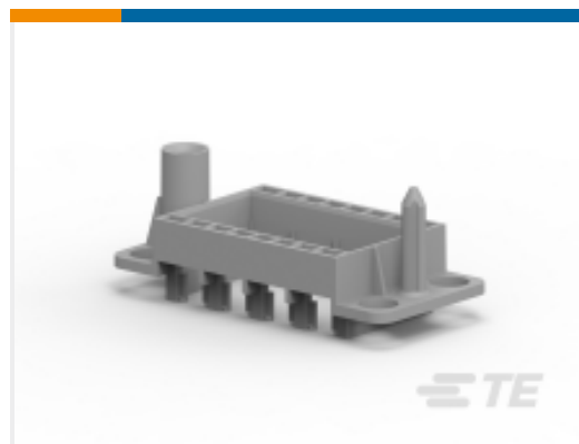
TE Part #T2071164101-000 H16BP-T4-M DOCKING FRAME_FLOATING