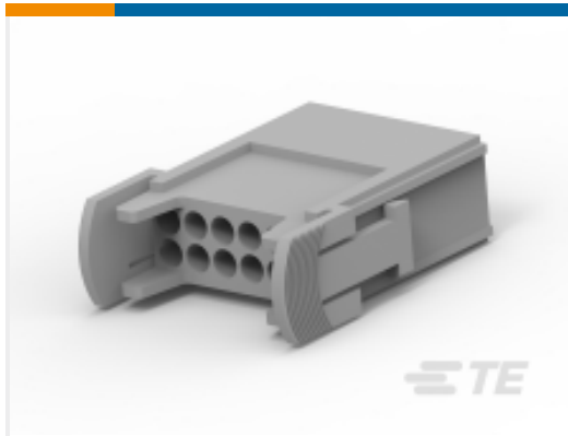
TE Part #T211122101-000 HMN-012-M