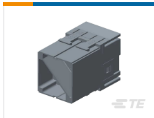
TE Part #T2111028101-000 HMN-D2-MC