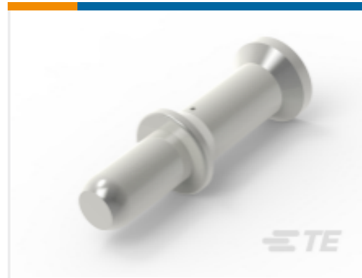
TE Part #T2050001025-000 CNM-25