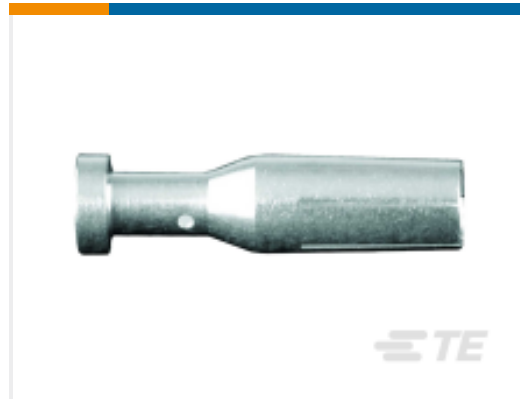
TE Part #T2040002100-000 CMF-10