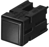
PWB Mount (One-piece plunger)