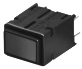
PWB Mount (Standard plunger)