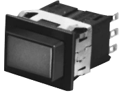
Panel Mount (Standard plunger)