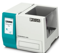
Thermal transfer printer for cards

https://www.phoenixcontact.com/us/products/5146464