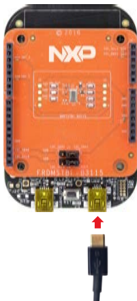
Figure 2: Connect kit to computer