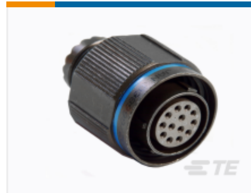
TE Part #YDTS26W25-35SNV001 PLUG ASSY