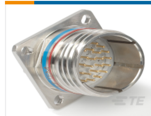
TE Part #YDTS20W17-06PAV001 D38999: Square Flange, 17-06 insert