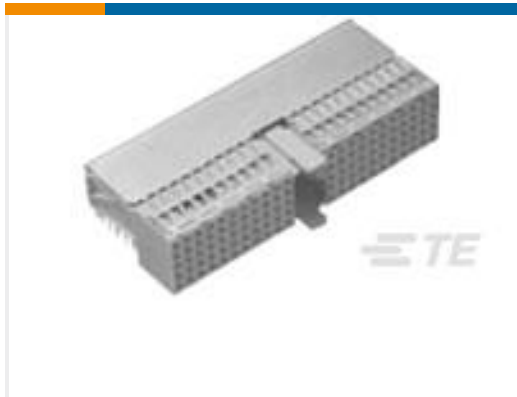
TE Part #352068-1 Z-PACK/A F-HDR 110P