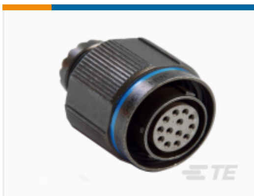
TE Part #YDTS26W25-24PNV001 PLUG ASSY