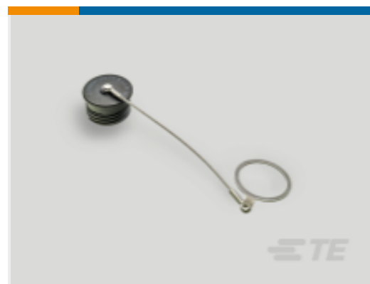
TE Part #YDTS32W25NV0010000 DUST COVER ASSEM