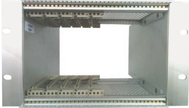
3U Subrack P/N CCA27-36-01 shown with 5 pairs of CG3-160 card guides

Subrack Contents (Generic): for 3U & 6U Subracks