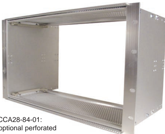
P/N CCA28-84-01: with optional perforated top/bottom covers.

EMC subracks for Compact PCI, VME64X or PXI are available off-the-shelf in assembled or kit form. Standard 19" width or custom sizes available (contact factory). Can accommodate all 3U (single height, 3.937" or 100mm) and 6U (double height, 9.187" or 233.35mm) 0.062" to 0.100" thick boards.