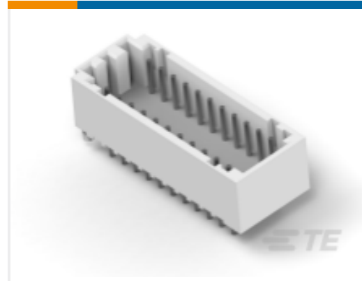
TE Part #2-292252-4 CT 2mm Dbl Row Assembly w/Boss: Vert.