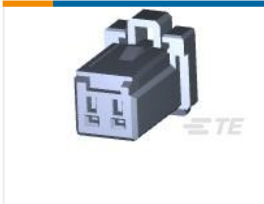
TE Part #1-1871465-2 DYNAMIC 1200S REC HSG 2P X BLA