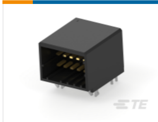
TE Part #1376135-1 Header Assembly: Wire-to-Board, 5A, gold plated