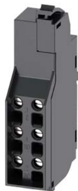
auxiliary switch changeover contacts type HP (14 mm) accessory for: 3VA11-15; 3VA20-26