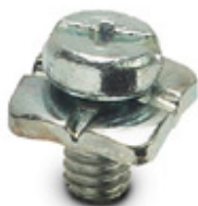
PE screw, for contact inserts HC-B / HC-BB / HC-DD / HC-D40 / HC-D64

Please be informed that the data shown in this PDF Document is generated from our Online Catalog. Please find the complete data in the user's documentation. Our General Terms of Use for Downloads are valid ( http://phoenixcontact.com/download )