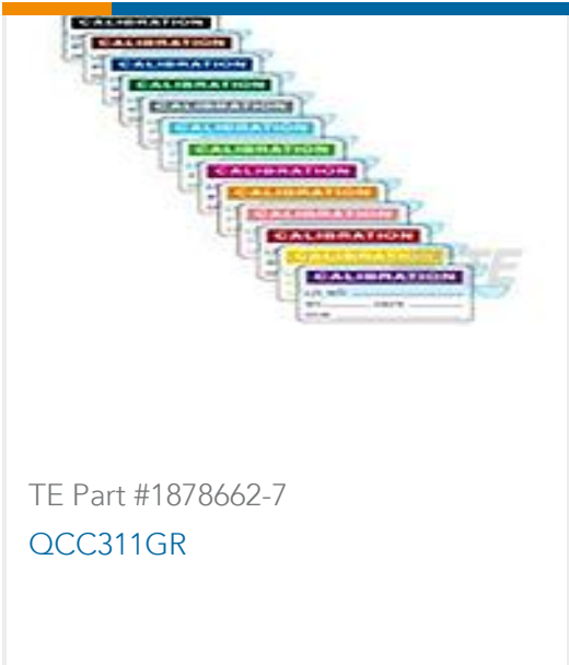
TE Part #1878662-7 QCC311GR