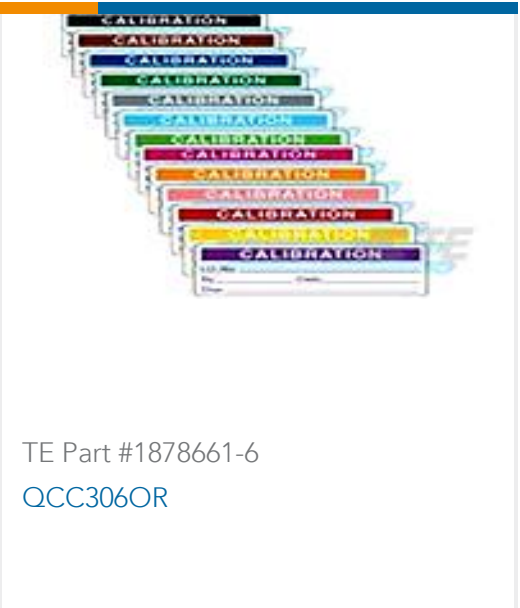
TE Part #1878661-6 QCC306OR