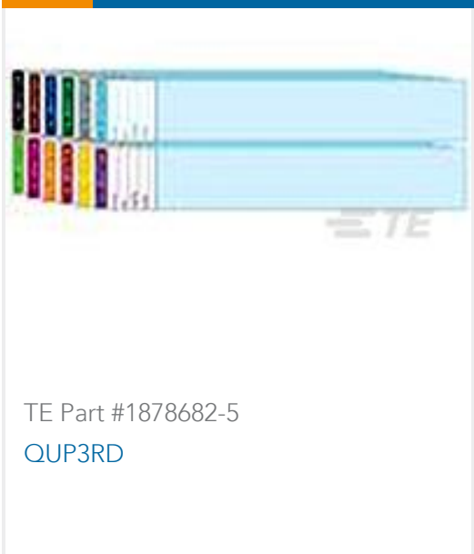
TE Part #1878682-5 QUP3RD