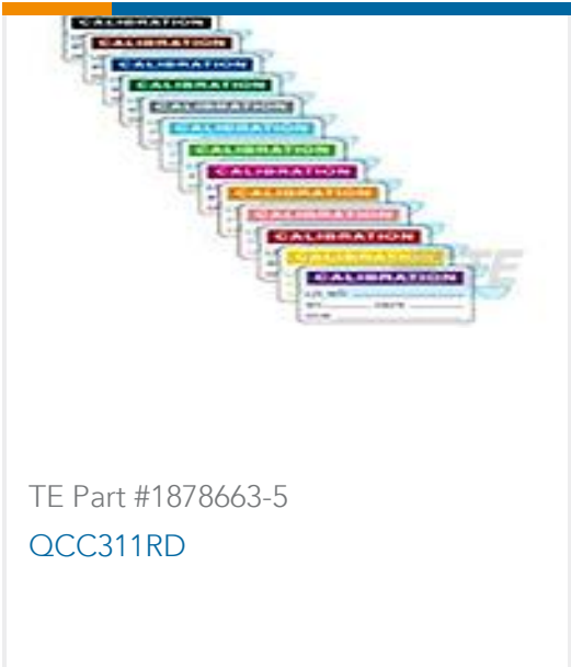
TE Part #1878663-5 QCC311RD