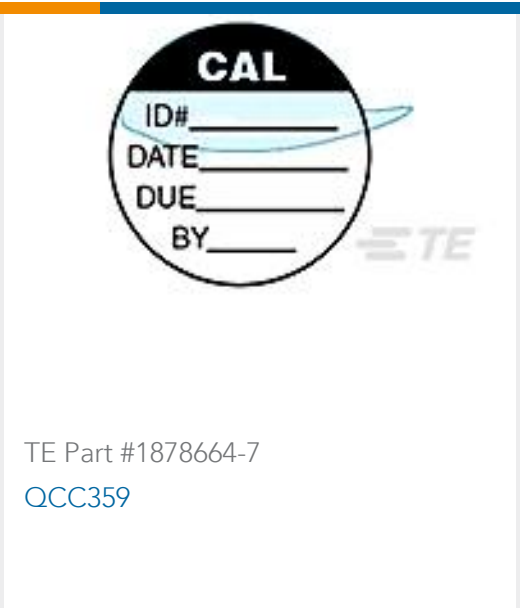
TE Part #1878664-7 QCC359