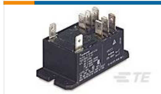
TE Part #6-1393211-0 T92P7A22-24