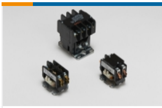
Definite Purpose Contactors(1)