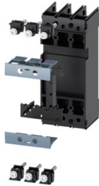
plug-in unit complete kit accessory for: circuit breaker, 3-pole 3VA11