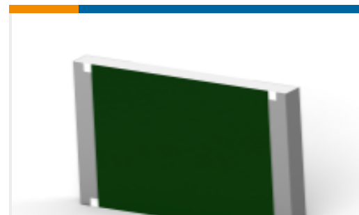
TE Part #8-2176407-8 3560 27R 5%