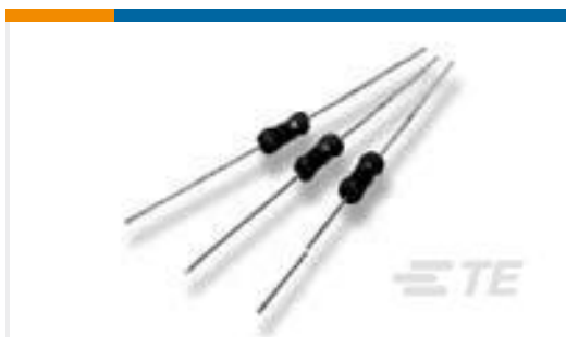
TE Part #4-1879350-2 RR01 5% 11R AMMO