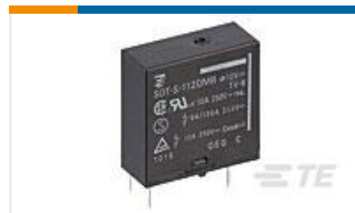
TE Part #8-1419125-5 SDT-S-106LMR,000