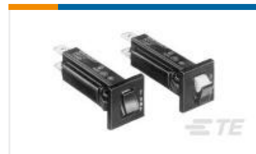
TE Part #1-1393250-7 W28-XQAT-15=W28