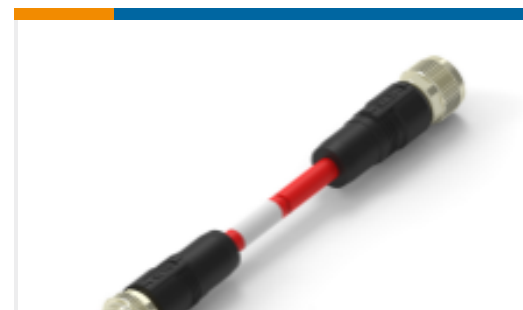
TE Part #TAA545B1411-060 M12A4-MS-FS-PVC-6.0M