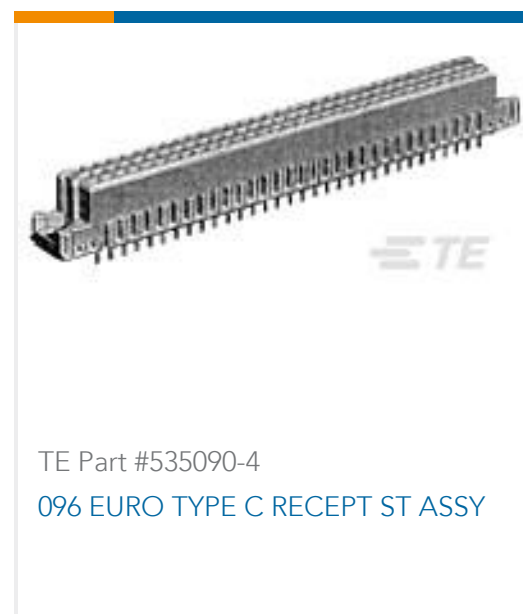
TE Part #535090-4 096 EURO TYPE C RECEPT ST ASSY