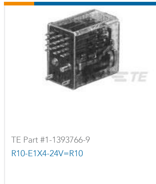
TE Part #1-1393766-9 R10-E1X4-24V=R10