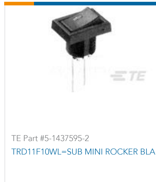
TE Part #5-1437595-2 TRD11F10WL=SUB MINI ROCKER BLA