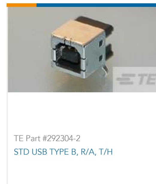
TE Part #292304-2 STD USB TYPE B, R/A, T/H