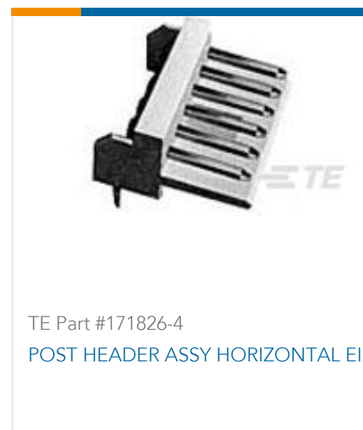
TE Part #171826-4 POST HEADER ASSY HORIZONTAL EI