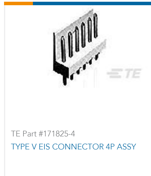
TE Part #171825-4 TYPE V EIS CONNECTOR 4P ASSY