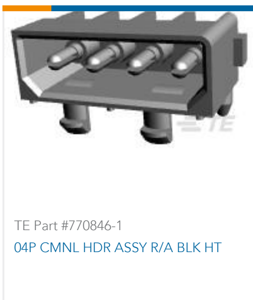
TE Part #770846-1 04P CMNL HDR ASSY R/A BLK HT