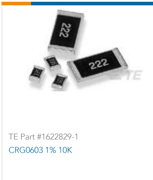
TE Part #1622829-1 CRG0603 1% 10K