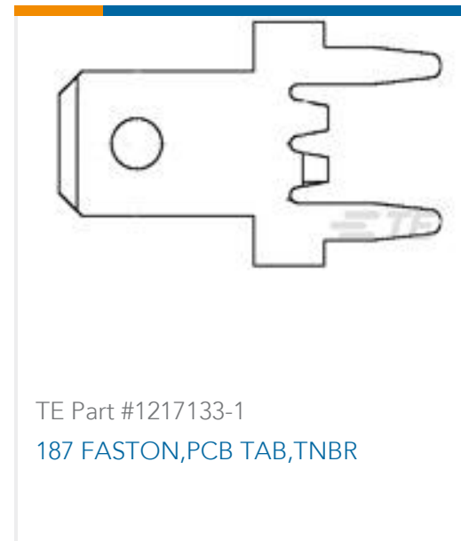
TE Part #1217133-1 187 FASTON,PCB TAB,TNBR