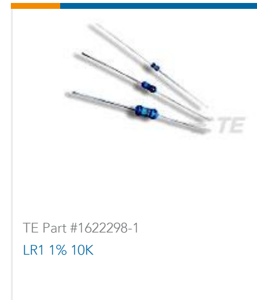
TE Part #1622298-1 LR1 1% 10K