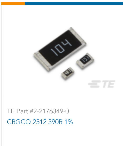
TE Part #2-2176349-0 CRGCO 2512 390R 1%