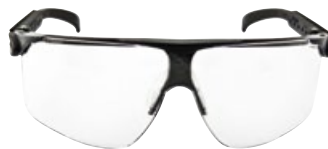
3M™ Maxim™ w/RAS

RAS (rugged anti-scratch coating) – for tough environments that require extremely scratch-resistant lenses.