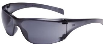
3M™ Virtua™ AP

Graceful unisex styling and integral sideshields.