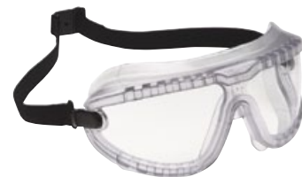
3M™ Lexa™ Splash GoggleGear™

Lightweight, low-profile splash goggle with adjustable lens angle.