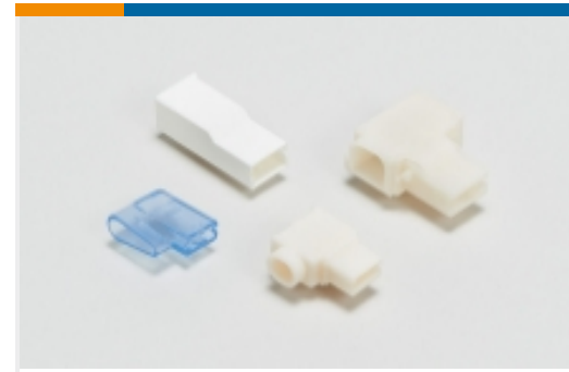
Crimp Terminal Housings(132)