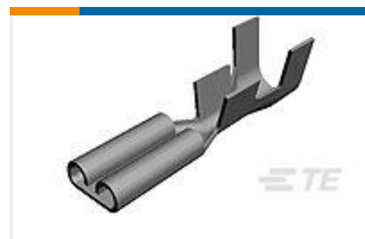
TE Part #160484-4 110 FASTON,REC.,20-17 AWG,BR