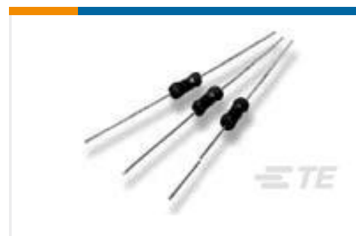
TE Part #4-1625885-3 1W SM M/OX 5% 220K