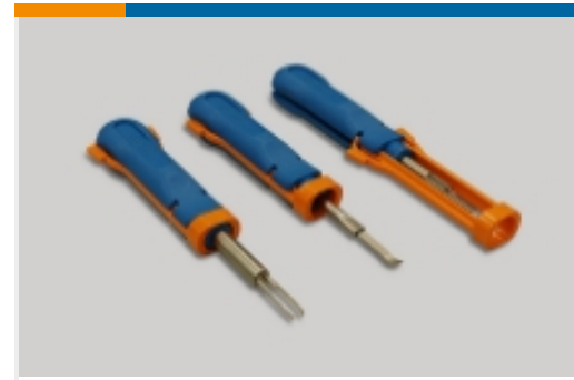
Insertion &amp; Extraction Tools(6)