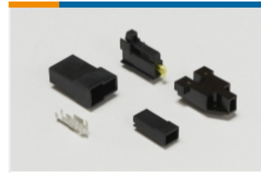
Magnet Wire Terminals(1)