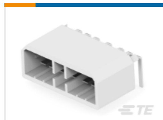
TE Part #171819-1 13P MIC CAP HSG