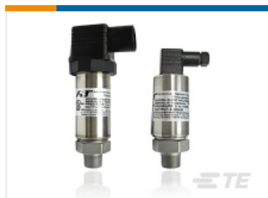
TE Part #11107897-00 Low Pressure IS Pressure Transducer