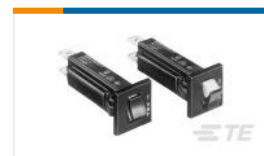
TE Part #1-1393250-7 W28-XQAT-15=W28