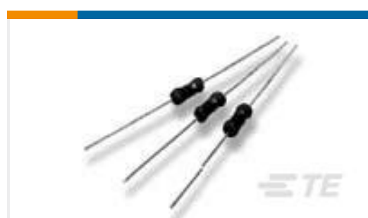
TE Part #4-1879350-2 RR01 5% 11R AMMO