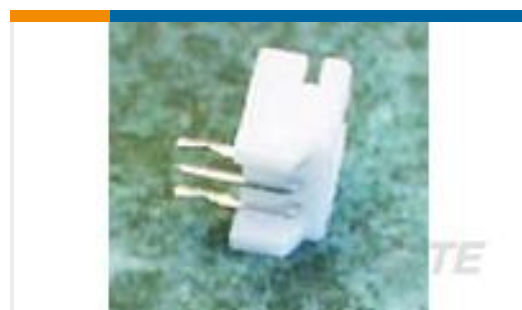
TE Part #1-440055-1 2.0MM,HDR,11POS,R/A