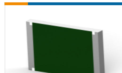
TE Part #8-2176407-8 3560 27R 5%