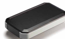
B= Black rubber corners