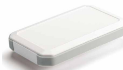
B= Black rubber corners