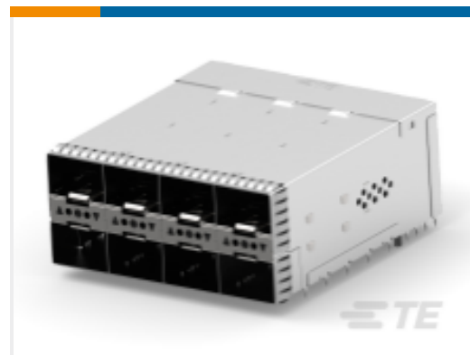
TE Part #3-2180324-2 zSFP+ STACKED 2X4 RECEPTACLE ASSEMBLY