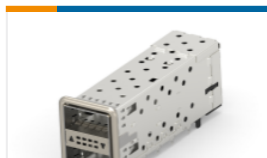
TE Part #2302407-1 QSFP+ ASSY, 2X1, GSKT, 2LP-OUTR, W/ CS GA