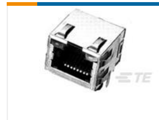
TE Part #1888566-2 IMJ, 1X1, PNL GRD, LED(Y/G), SN