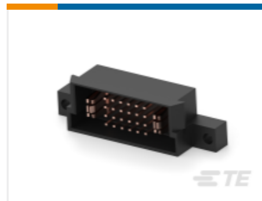
TE Part #1-6600383-9 MBXL VERT HDR 1P+24S+1P STR