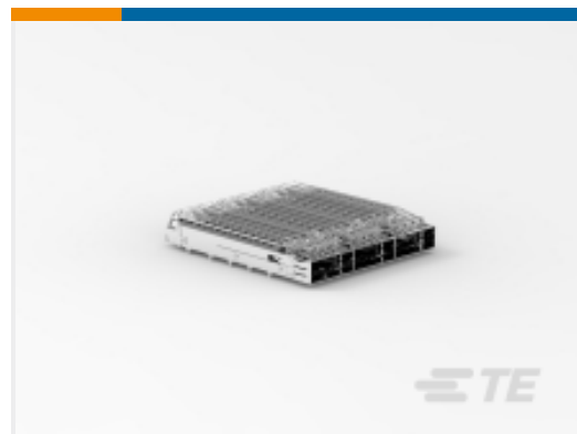
TE Part #4-2170740-1 QSFP28, 1X3, CAGE ASSY, SPRING, HS, LP