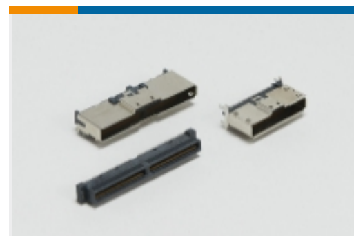
Internal I/O Connectors(133)