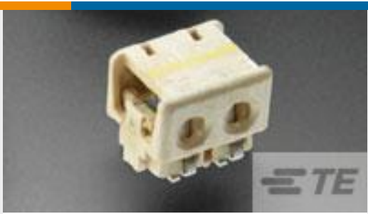
TE Part #2-2106431-4 Connector, SMT-IDC PASS THRU, 4 POS, 22