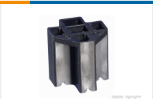
TE Part #1-1904045-1 V23333Z0001A007-EV-100