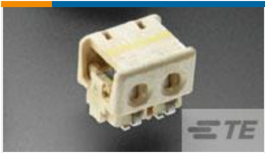
TE Part #1-2106431-2 Connector, SMT-IDC PASS THRU, 2 POS, 20