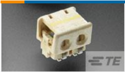
TE Part #2-2106003-3 Connector, SMT-IDC, 3 position, 22AWG