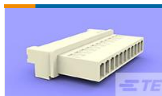
TE Part #1969588-2 HSG, REC, FREE-HANGING, SINGLE ROW, EP2.5