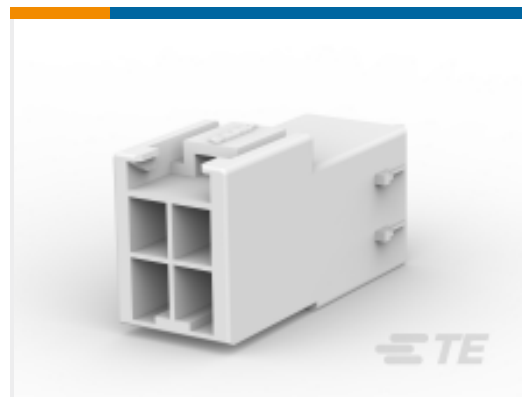
TE Part #177908-1 STD Temp Power Double Lock Cap