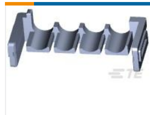
TE Part #177920-1 POWER DBL LOCK PLATE 3.96MM 4POS