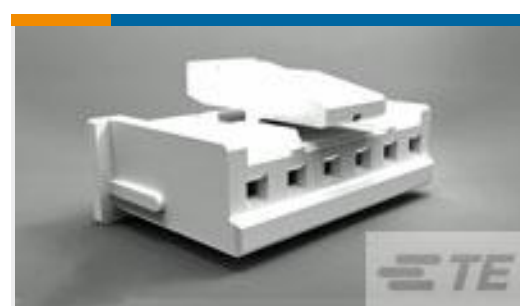
TE Part #1969442-7 EP 2.5 TPA Housing, 7 Pos