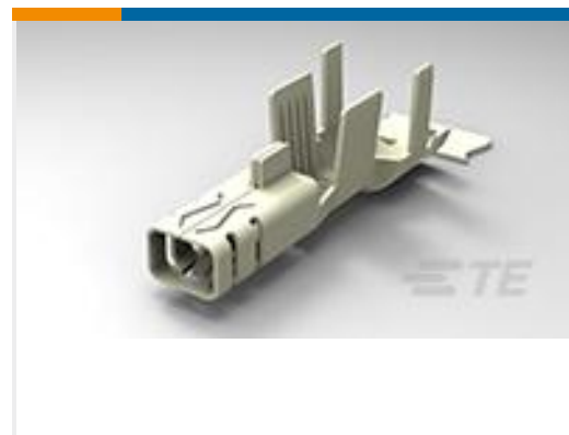
TE Part #1971787-2 PTL RECEPTACLE CONTACT, 2X18 AWG