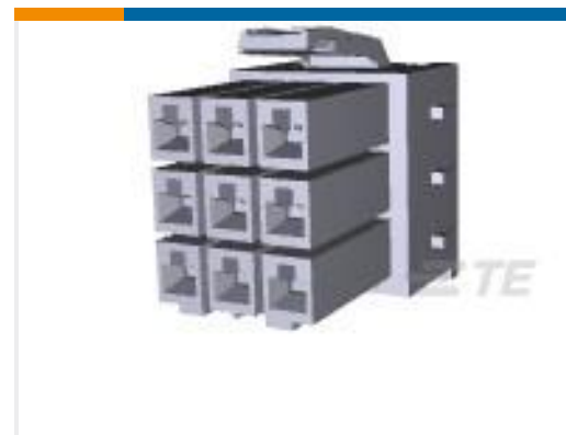
TE Part #177903-1 POWER DBL LOCK PLUG HSG 9P