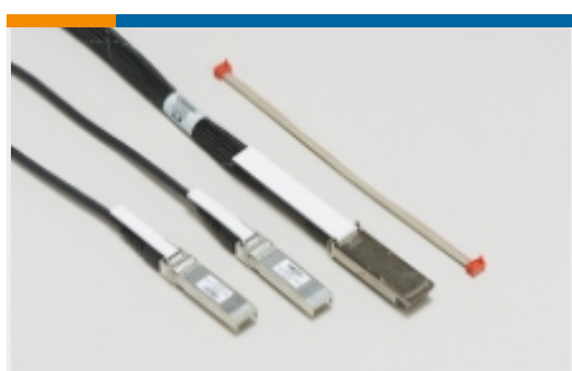
Pluggable I/O Cable Assemblies(13)