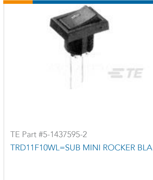
TE Part #5-1437595-2 TRD11F10WL=SUB MINI ROCKER BLA