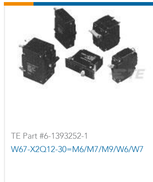
TE Part #6-1393252-1 W67-X2Q12-30=M6/M7/M9/W6/W7