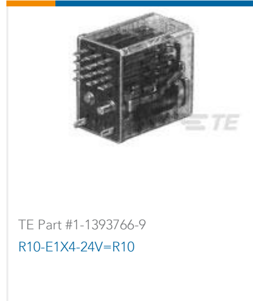
TE Part #1-1393766-9 R10-E1X4-24V=R10