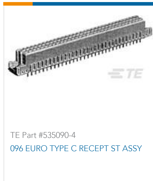
TE Part #535090-4 096 EURO TYPE C RECEPT ST ASSY