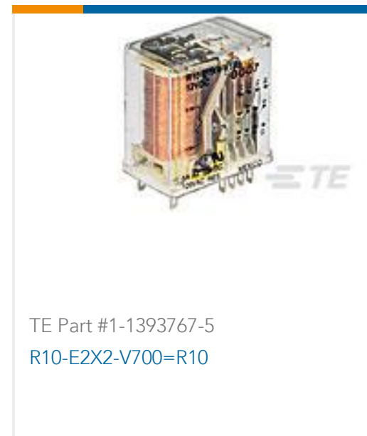
TE Part #1-1393767-5 R10-E2X2-V700=R10