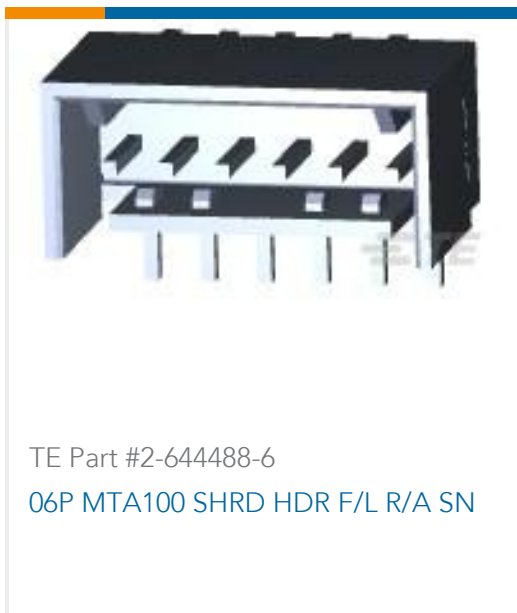
TE Part #2-644488-6 06P MTA100 SHRD HDR F/L R/A SN