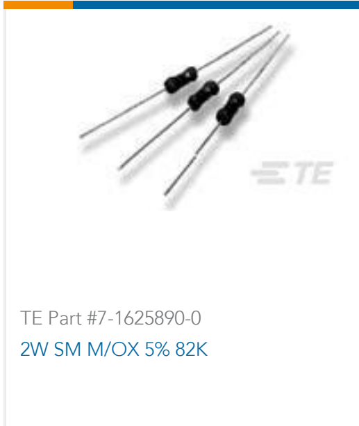
TE Part #7-1625890-0 2W SM M/OX 5% 82K