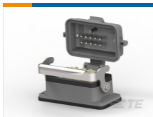
TE Part #T2120100219-000 ZGG-10DSTK,1-7,2-8,3-9,4-6,5-10