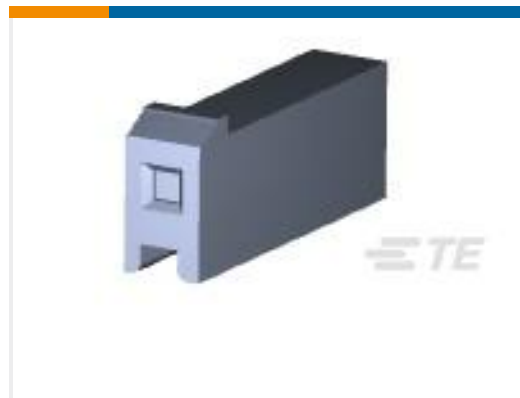
TE Part #640250-1 01P SL156 HSG W/LCK RAMP NATL