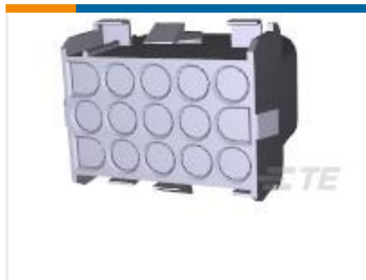
TE Part #1-480711-9 15P UMNL CAP HSG BLK