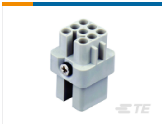
TE Part #T2020082201-000 HD-008-F