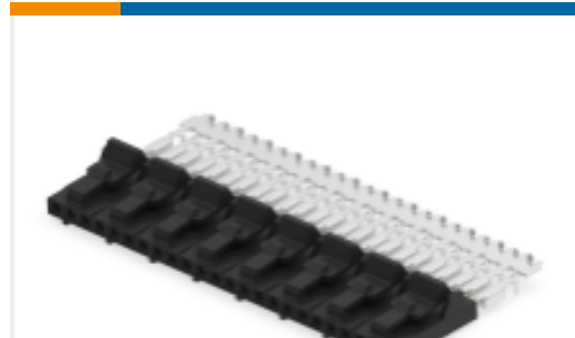
TE Part # 5-103957-2 8X3 MTE RCPT SR LATCH .100CL