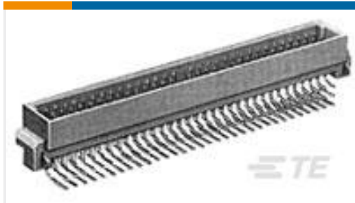
TE Part #5650913-5 ASSY,PIN,EUROCARD,TYPE C,LEAD-