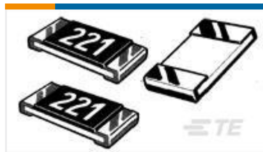
TE Part #2-1622820-9 3520 27R 5%