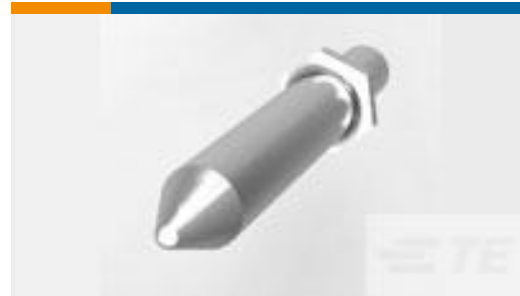
TE Part #223982-1 Stainless Steel Guide Pin M4x0.7