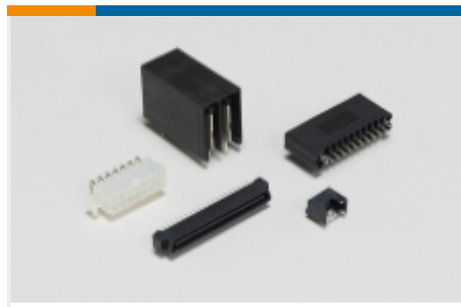
Standard Rectangular Connectors(2)