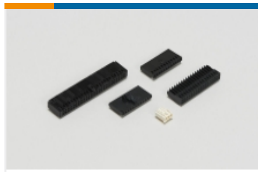
Wire-to-Board Connector Assemblies & Housings(585)