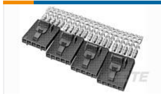
TE Part # 5-103960-2 8X3 MTE RCPT SR LATCH .100CL