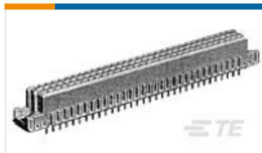
TE Part #5535090-5 ASSEMBLY,RECEPTACLE,EUROCARD, T