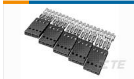
TE Part # 5-103972-2 8X3 MTE RCPT SR RIBBED .100CL