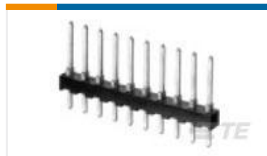
TE Part #825440-4 MOD 2 PINHDR 2X04P.