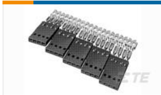
TE Part # 5-103969-2 8X3 MTE RCPT SR RIBBED .100CL