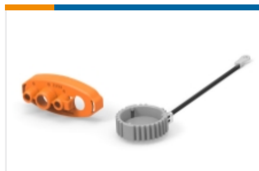
Connector Caps & Covers(40)