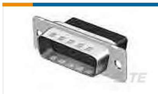
TE Part #207464-2 CRIMP SNAP PLUG ASSY,SZ 3