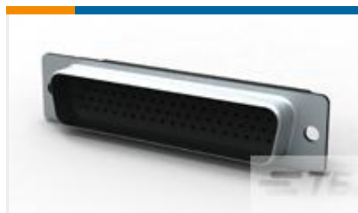
TE Part #1658674-1 HDP-22,PLUG,SIZE 5,78 POSN