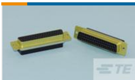
TE Part #1658640-1 HDP-20,RCPT,SIZE 5, 50 POSN