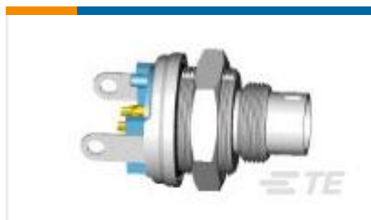
TE Part #9-1437719-3 T01-0580-P08-MALE REC PANEL MOUNT SOLDER