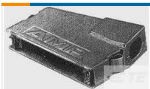
TE Part #5749204-2 68 50SR KIT,75D,UK