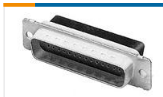
TE Part #1658672-1 HDP-22,PLUG,SIZE 3,44 POSN