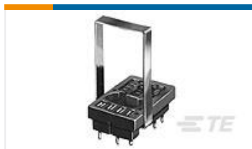
TE Part #4-1393159-0 20C259=SPRING,HOLD-DOWN,R10,0