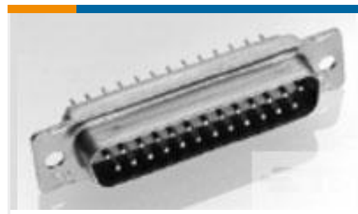
TE Part #1757819-6 AMPLIMITE,ASY,PLUG,STD,109,ZN,1, CT