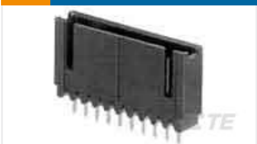
TE Part #5-103414-8 10 MODII HDR SRST SHRD LF