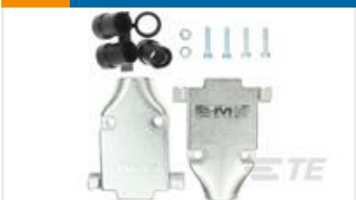
TE Part #5748676-2 DIE CAST CBL CLMP KIT,SZ 2