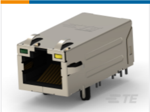
TE Part #5-2337992-5 RJ45 JACK MAG. POE 1GB LED 1X1 INV.