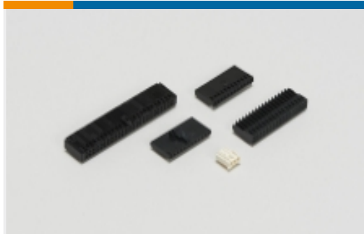
Wire-to-Board Connector Assemblies & Housings(5)