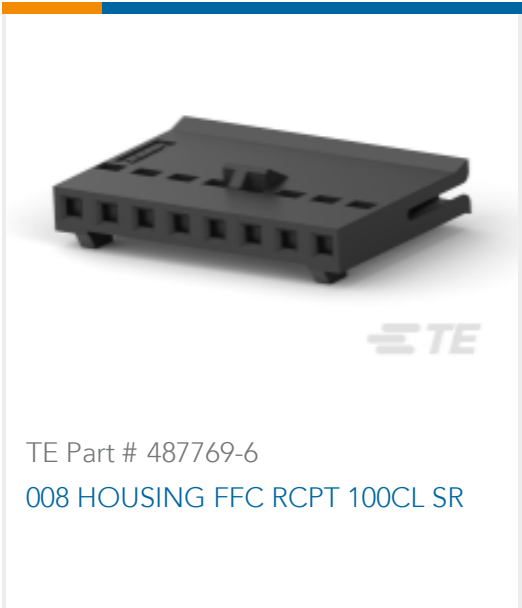
TE Part # 487769-6 008 HOUSING FFC RCPT 100CL SR