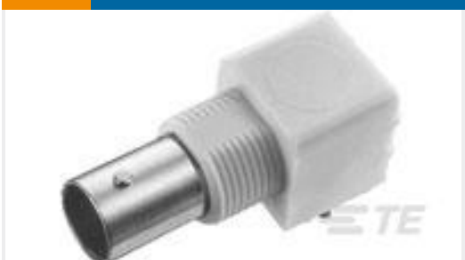
TE Part #1-5227161-6 RTANG JACK W/MTG PINS,BNC PCB