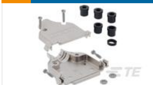
TE Part #5748676-3 DIE CAST CBL CLMP KIT,SZ 3