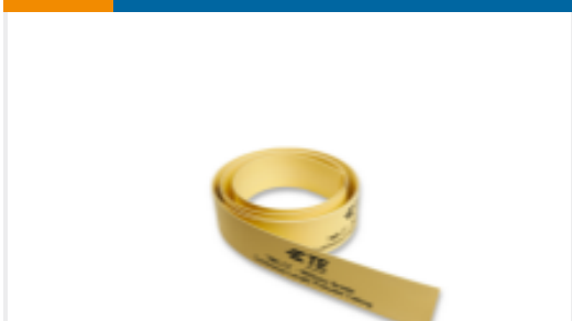
TE Part #ER9636-000 CONTINUOUS TUBE MILITARY GRADE TMS-CT