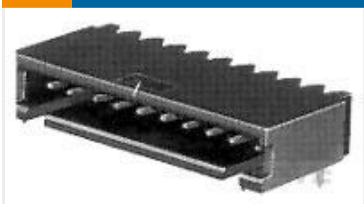
TE Part #103361-4 06 MODII HDR SRRA SHRD .100CL