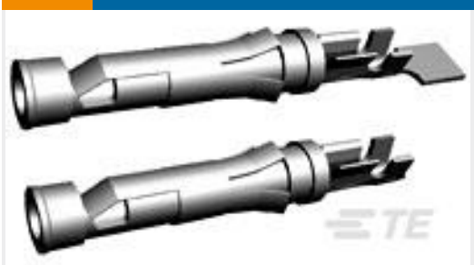
TE Part #1-66105-8 III+ SKT,24-20,30AU/FL,SMPACK