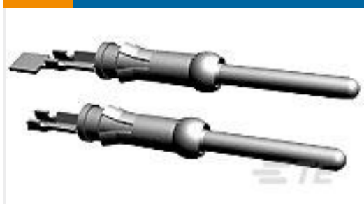
TE Part #1-66103-9 III+ PIN,24-20,TIN,SMPACK