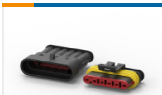
TE Part #282104-1 AMP SUPERSEAL 1.5MM, CONNECTOR HOUSING