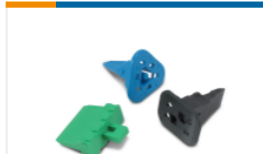
TE Part #W2S Wedgelocks: DEUTSCH DT