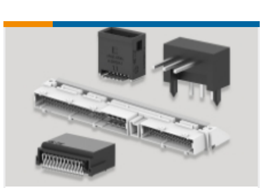
PCB Headers & Receptacles(3202)