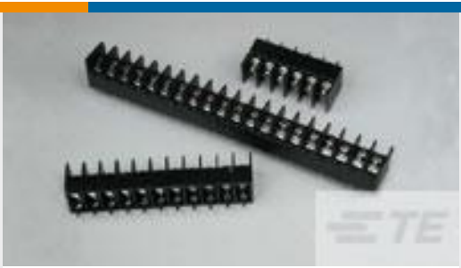
TE Part #1546657-2 2P PCV DUAL BARRIER,0.250