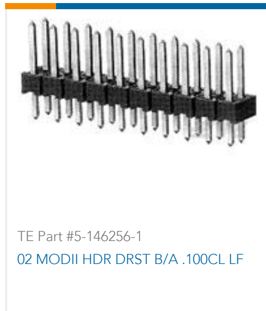
TE Part #5-146256-1 02 MODII HDR DRST B/A .100CL LF