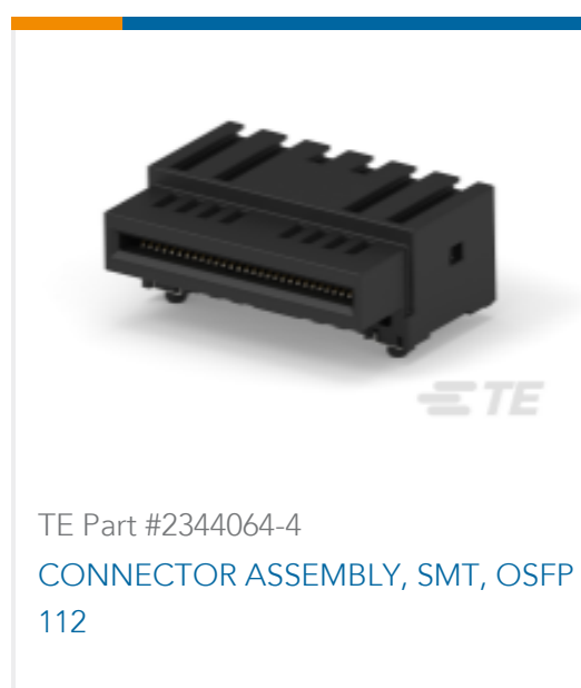
TE Part #2344064-4 CONNECTOR ASSEMBLY, SMT, OSFP 112