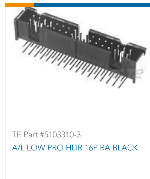
TE Part #5103310-3 A/L LOW PRO HDR 16P RA BLACK