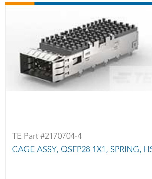
TE Part #2170704-4 CAGE ASSY, QSFP28 1X1, SPRING, HS