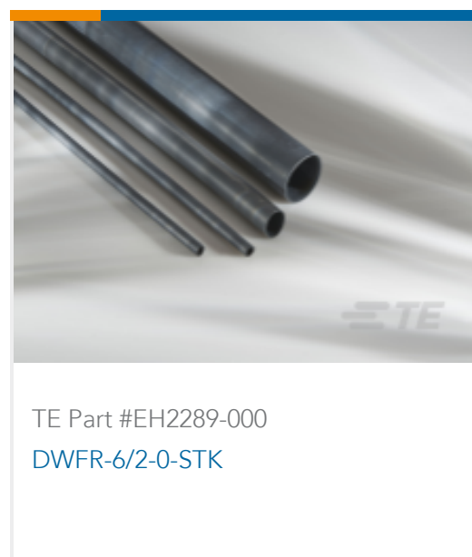
TE Part #EH2289-000 DWFR-6/2-0-STK