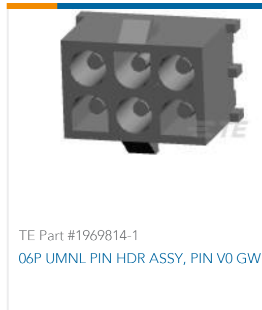
TE Part #1969814-1 06P UMNL PIN HDR ASSY, PIN V0 GW