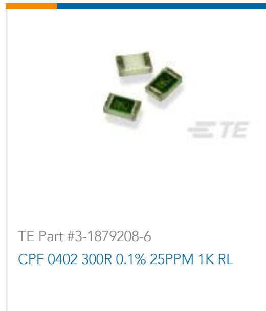
TE Part #3-1879208-6 CPF 0402 300R 0.1% 25PPM 1K RL