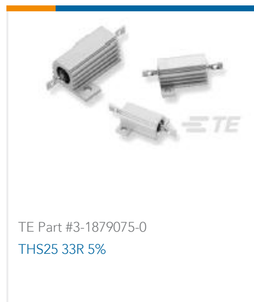
TE Part #3-1879075-0 THS25 33R 5%