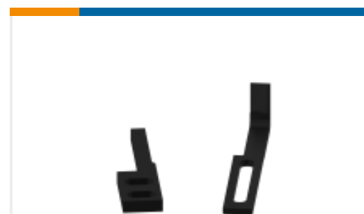
TE Part #240639-1 STRIPPER *1