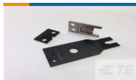
TE Part #1-2217206-6 Blade, Slug