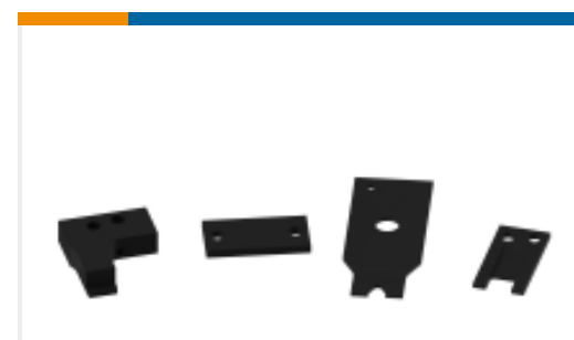
TE Part #240644-1 PLATE-REAR SHEAR