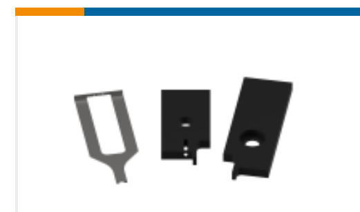
TE Part #2119791-9 DEPRESSOR, WIRE