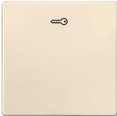
DELTA i-system electrical white Rocker switch with door opener symbol for pushbutton, 55x 55 mm