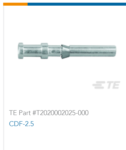
TE Part #T2020002025-000 CDF-2.5