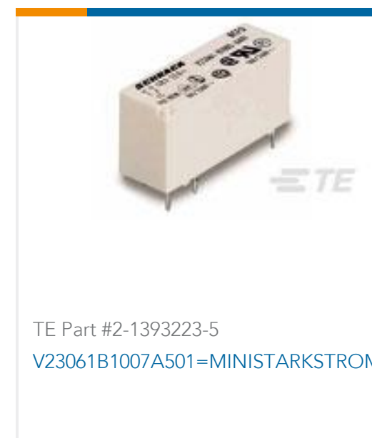
TE Part #2-1393223-5 V23061B1007A501=MINISTARKSTROM