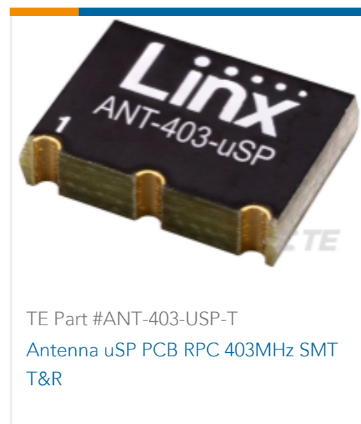
TE Part #ANT-403-USP-T Antenna uSP PCB RPC 403MHz SMT T&R