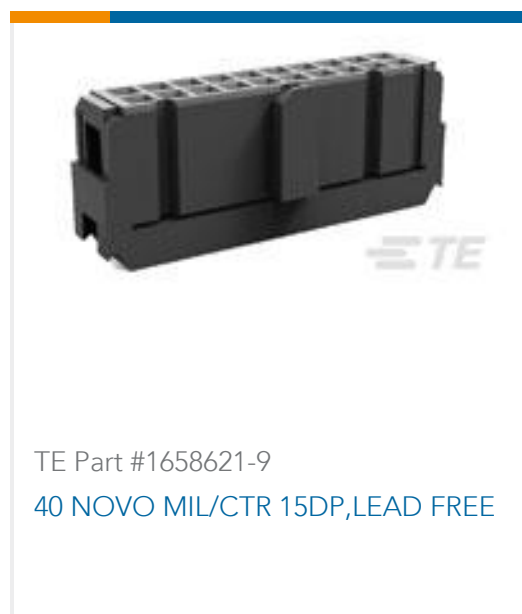
TE Part #1658621-9 40 NOVO MIL/CTR 15DP, LEAD FREE