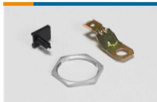
Other Automotive Connector Accessories(6)