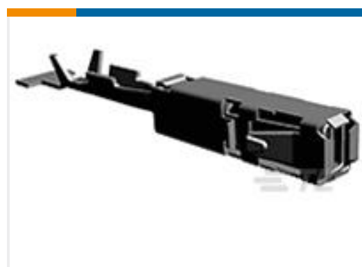
TE Part #1241381-3 AMP MCP 1.5K, CONTACT, SWS, (LP)