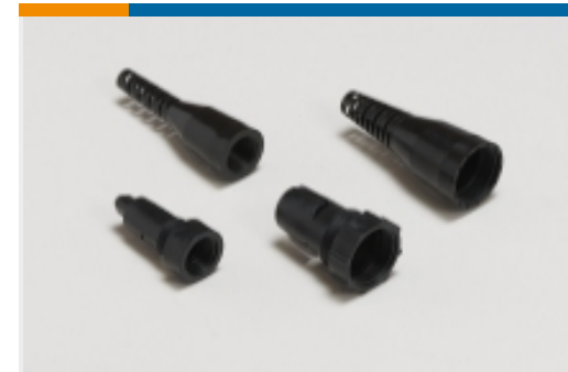
Connector Strain Relief(1)