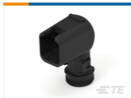
TE Part #1011-240-0605 BKSHL, 6P, BLK, PLG, RA, NW8.5/10/13