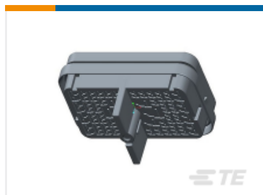
TE Part #DRB12-102PAE-L018 REC, 102P, BLK, E, CAP, A