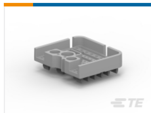
TE Part #WB-51PAL WEDGE LOCK, 102P, REC, GRY, LF, DRB, A