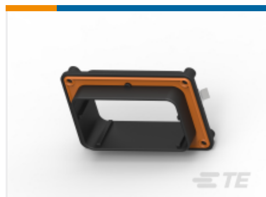
TE Part #DRBF-1A DEUTSCH DRB Mounting Accessories