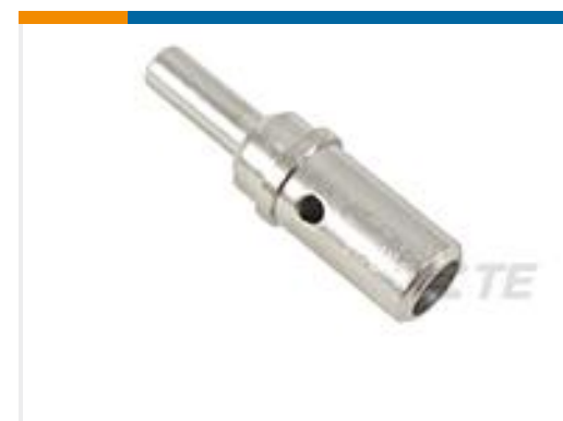
TE Part #0460-204-08141 PIN, SOLID, SIZE 8, 8-10AWG, NI