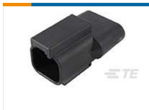
TE Part #DT04-2P-RT21 REC, 2P, BLK, 511 OHM RESISTOR, NI