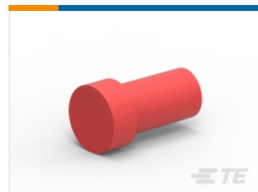
TE Part #114019-ZZ SEALING PLUG, SIZE 4, WHT