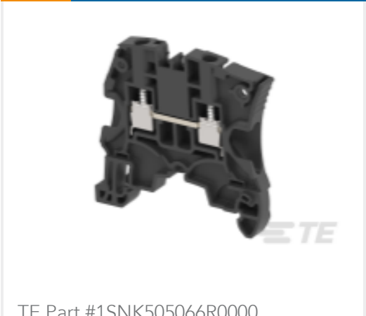
TE Part #1SNK505066R0000 ZS4-BK