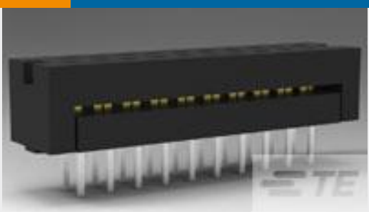
TE Part #1-746610-9 40 DIP PLUG, 100CL, LEAD FREE