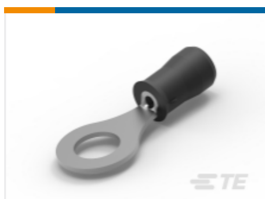
TE Part #320563 PIDG Ring Tongue Terminals